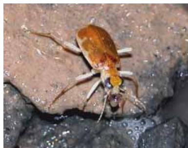
FIGURE 1. Adult Cicindis horni Bruch feeding on fairy shrimp.