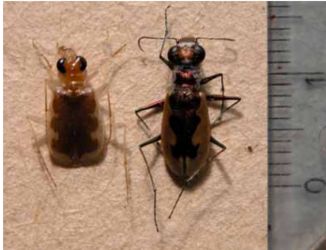
FIGURE 11. Adult Cicindis horni Bruch and Cicindela hirsutifrons Sumlin.