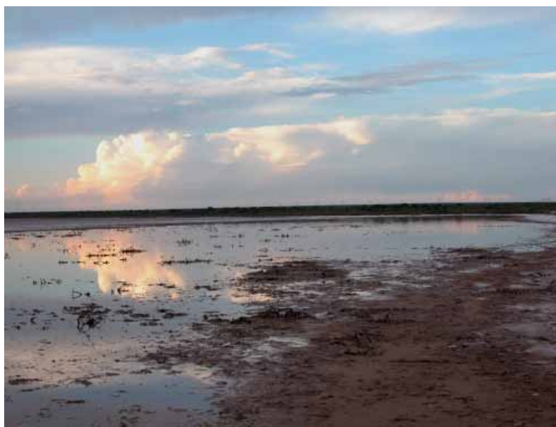
FIGURE 3. Vernal pool at margin of Salinas Grandes, Córdoba Province, Argentina at Km 895.5, National Highway 60 after the first of seasonal rains in January, 2004.