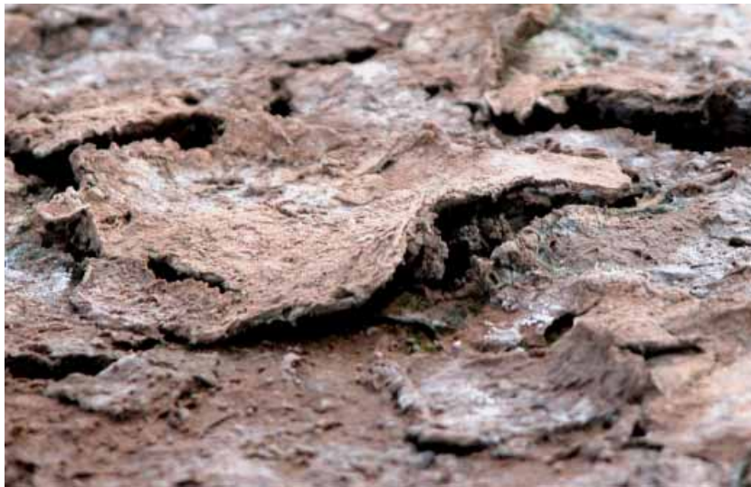
FIGURE 9. Tiled-soil polygon typical of some stretches of the shoreline surrounding Salinas Grandes.

pool surface of the total available of 15,000 square meters. Given the total size of the vernal pool, there were likely thousands of active individuals. At about this time, they also began flying to the UV light set up about 20 meters from the water's edge. The seven individuals we found at UV light were either on the sheet moving slowly or running erratically on the ground in front of the sheet. These beetles are slow fliers, although their take off from the water surface is rapid. We observed two types of flight patterns (see crepuscular activity above for one of these). When it was dark, after 2115 hrs, activity of the adults was mostly swimming, although many beetles that we tried to capture rose and flew well away above the water surface on which our net swept.