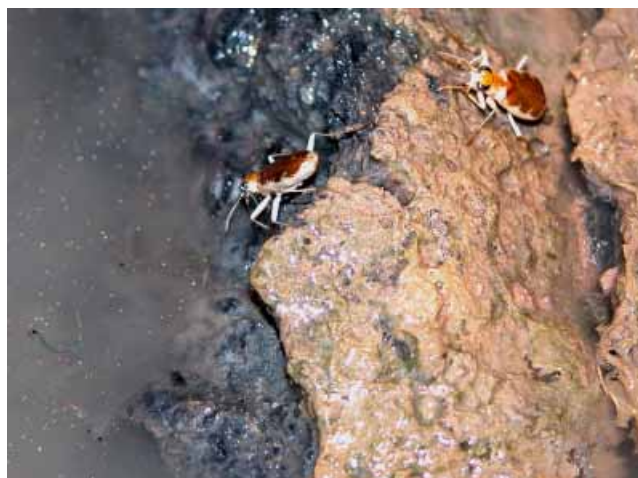
FIGURE 13. Adult Cicindis horni Bruch perching with slightly bioluminescent fairy shrimp nearby in water (lower left of image).