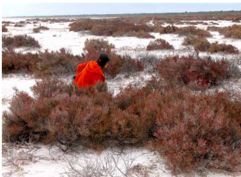
FIGURE 2. Margin of the Salinas Grandes, Córdoba Province, Argentina, at Km 895.5, National Highway 60 in October, 2003.