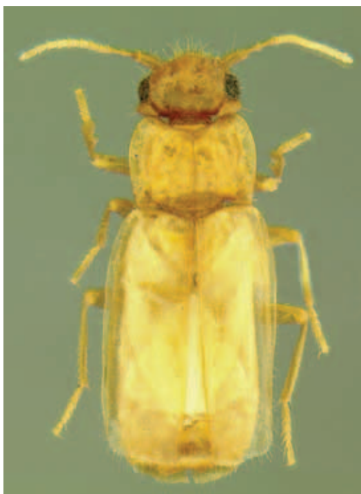
FIGURE 1. Xenaroswelliana deltaquadrant Erwin, male, dorsal aspect.