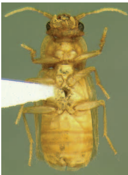
FIGURE 2. Xenaroswelliana deltaquadrant Erwin, male, ventral aspect.