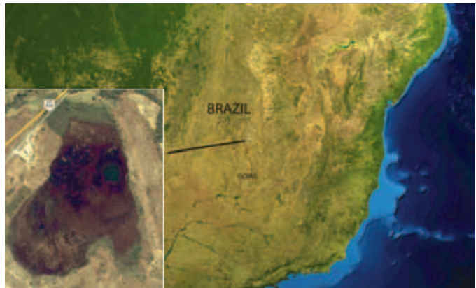
FIGURE 5. Geographic distribution map for Xenaroswelliana deltaquadrant Erwin with aerial view of marsh at the type locality along Brazil's Highway 20 in Goiás State, Brazil.

The uniqueness of the single known specimen of this new taxon warrants its description for the purposes of promoting the discovery of more individuals for a more in-depth study of its relationships amongst the Carabidae and its natural history. In finding more individuals, attention must be given to recording its way of life in all aspects — possible host species if any, microhabitat, micro-vegetation zone, behavior, etc.