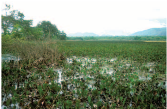
FIGURE 6. The vegetation and water body at the type locality in Goiás State, Brazil.